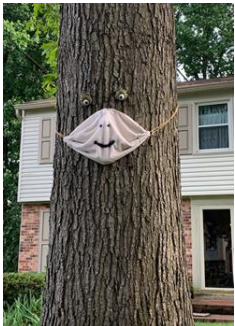
A member sent us this picture of their tree observing the COVID-19 guidelines. Cute!