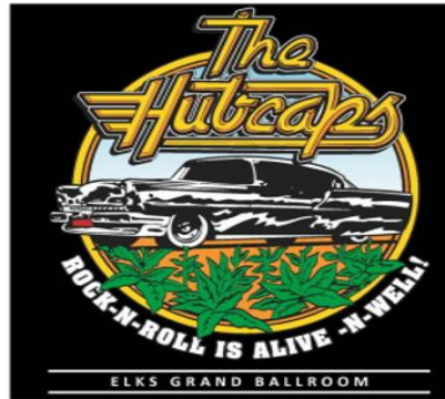
Table reservations for 4 or more are available

Tickets are $45 in advance or $50 at the door & are available from the bartender or call Carl Ogle 703-560-2188 ext. 5.